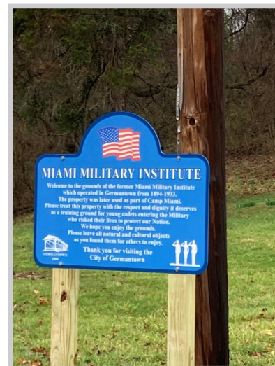
City crews installed the new Miami Military Institute/Camp Miami sign at the Warren Street entrance

May is Bicycle Safety Month, and the U.S. Department of Transportation's National Highway Traffic Safety Administration (NHTSA) urges bicyclists and motorists to share our roadways by obeying the traffic laws and respecting each other's rights.