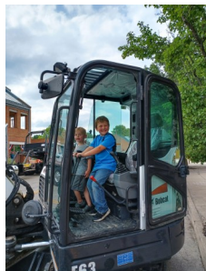
Saturday Night Out—July 16th